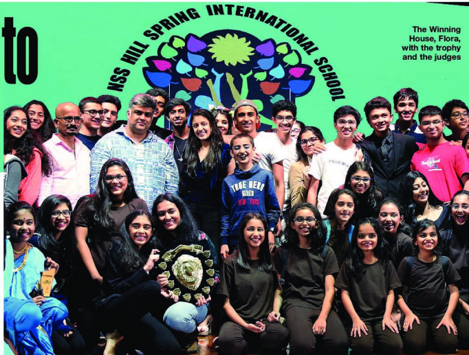
The Winning House, Flora, with the trophy and the judges