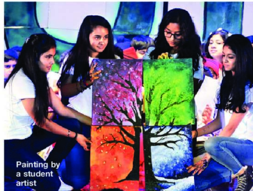
Painting by a student artist