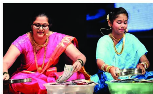
Students playing the role of fish sellers in the play, Have you any carbon sense?