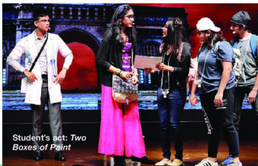
Student's act: Two Boxes of Paint