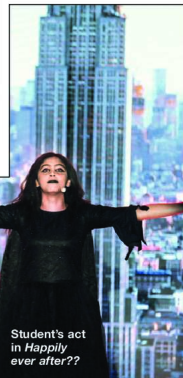
Student's act in Happily ever after??